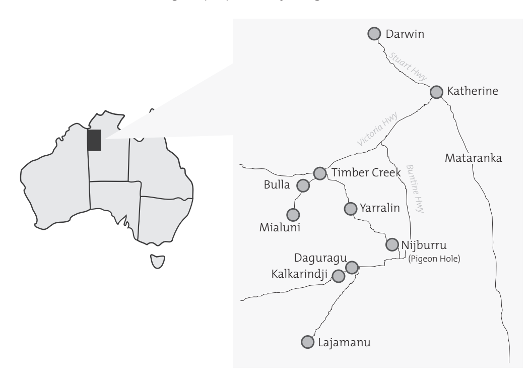
Figure 2: Location of Katherine West Health Board community health centres